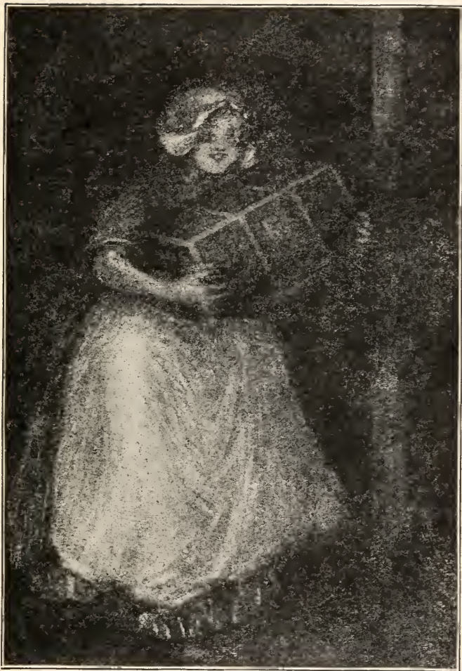
When the British Came.

"ANETJE CAME BACK WITH THE BOX IN HER ARMS."